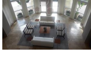
Palmetto Place lobby