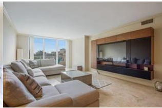
Palmetto Place Aerial view 03_99SEMiznerBlvd201_177 ...02_99SEMiznerBlvd201_1000...01_99SEMiznerBlvd201_1_Liv...