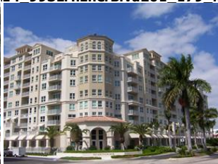
Palmetto Townsend Boca Resor_0141