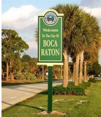
welcome to Boca raton