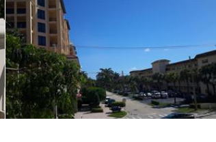
08_99SEMiznerBlvd201_9_2n...09_99SEMiznerBlvd201_325 ... 20191023_114811 20191023_114845[1]