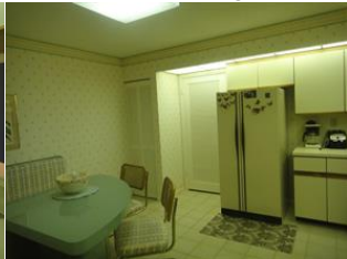
Eat in Kitchen