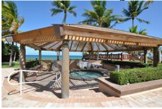
OCEAN HOT TUB