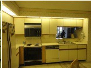
Eat in Kitchen