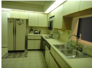
Eat in Kitchen