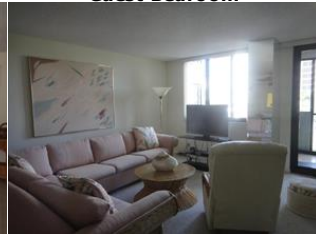
living rm area